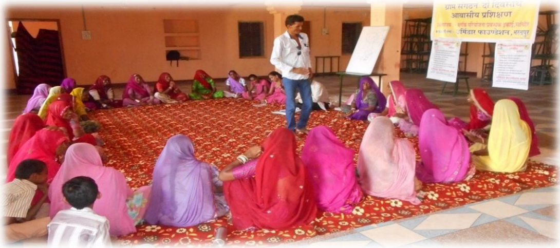
Vo's Members 2 days residential training Programme