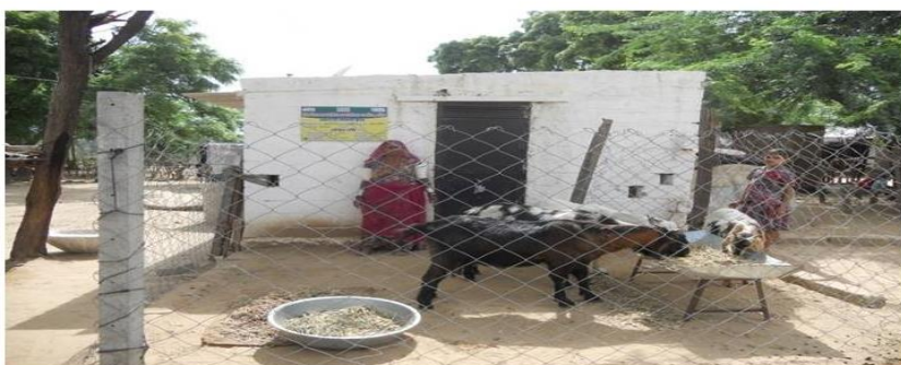
Goat Cluster- Goat Vaccination.