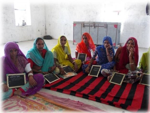
Woman literacy - Singature Learning SHG Member .